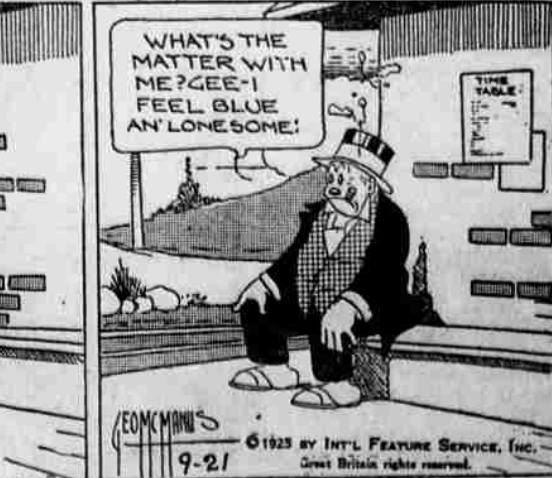
© 1925 BY INT'L FEATURE SERVICE, INC. Great British rights reserved.