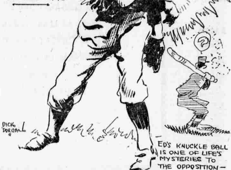
EDDIE'S KNUCKLE BALL IS ONE OF LIFE'S MYSTERIES TO THE OPPOSITION—

A VERY GOOD REASON WHY THE ATHLETICS ARE UP THERE IN FRONT SHOWING THEIR HEELS TO THE REST OF THE BOYS