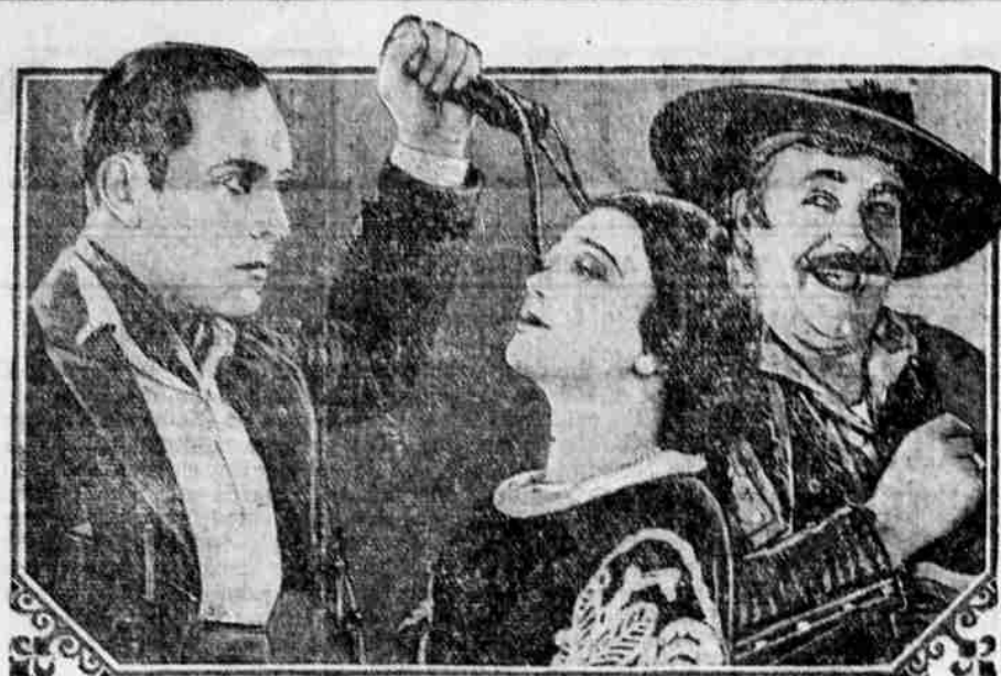
Ricardo Cortez, Jetta Goudal and Noah Beery in the Raoul Walsh Production "The Spaniard" A Paramount Picture

Heavy-Duty Passenger—Full Balloon Semi-Balloon—Heavy-Duty Commercial A C-T-C Tube adds mileage to almost any casing