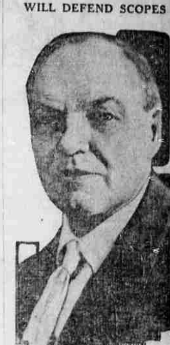
Latest portrait of Clarence Darrow, noted Chicago lawyer, who will be one of the counsel for the defense in the trial of John T. Scopes for violation of the Tennessee anti-evolution law.