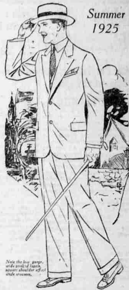
Note the bag, girth, wide waist of legs, square shoulder effect wide trousers.