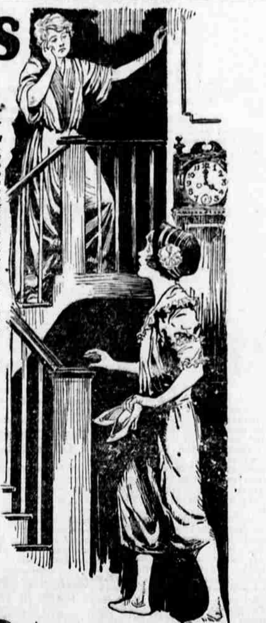
"Suddenly I heard her coming. It was a tiny sound. I peered through the gloom, and there in the grey of early dawn stood my child, her face white—her eyes starting from their sockets." —From "Saving Helen" in True Story for July

Don't Miss These Other Intensely Absorbing Features in July True Story: