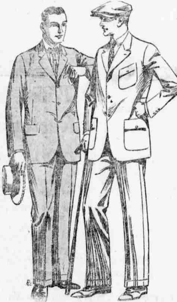
A Special Showing of

"I hated cooking because all I ate turned sour and formed gas. I drank hot water and olive oil by the gallon. Nothing helped until I took Adelerka." Unless due to deep-seated causes, Adelerka helps any case gas on the stomach in a surprisingly QUICK time. It is a wonderful remedy to use for constipation—it often works in one hour and never gripes. Magill & Erskine.