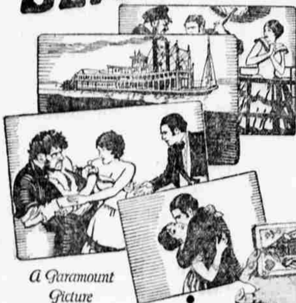
A Paramount Picture

A rousing romance-thriller of California in the gold rush days of '49. Produced by the man who made "Call of the Canyon."