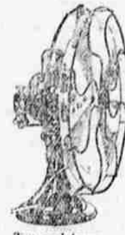
Ten cool hours for a nickel!

The original Bulgars were Tartars, akin to the Tartars, and appeared first in history toward the close of the seventh century. They were then a wild tribe of horsemen, who, under their chieftains, known as halyars, ravaged the territory between the Ural mountains and the Volga river.