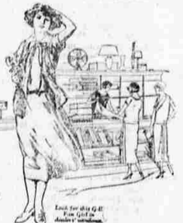
Each for the G-E Fan Girl in America's admiration.