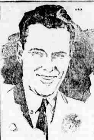
Thomas Meighan in "The Frontier of the Stars" A Paramount Picture.

WANTED—Girl for general housework. Apply at Hotel Portland immediately. 13-49-51c