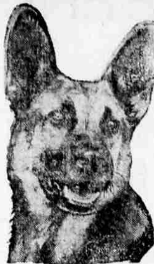
Strongheart The Weibler Dog in 'The Silent Call'

Hubble Service Station CORNER BOND AND OREGON