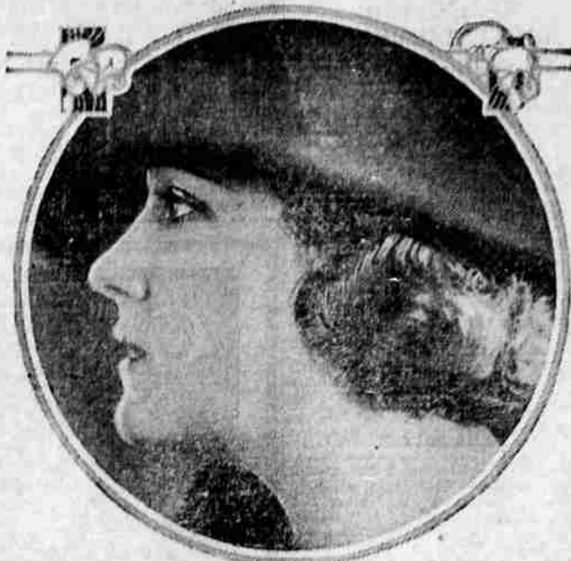
Gloria Swanson in the Paramount Picture 'THE GREAT MOMENT' Liberty Tonight and Thursday.

"The baseball team is bound to make something out of this smoker, as everything is arranged on a percentage basis. The supporters of