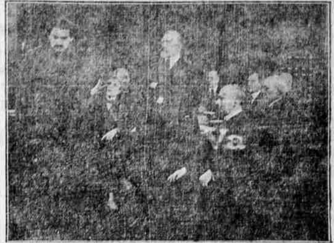
Scene from "The Deceiver," showing tonight last time.