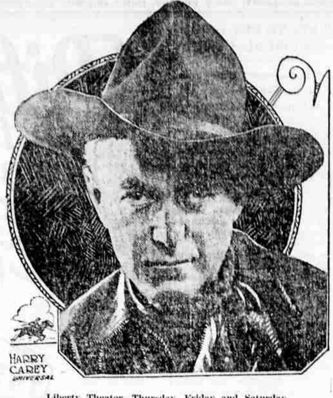
Liberty Theater, Thursday, Friday and Saturday.

For principal and interest due and owing upon a prommissory note for to Bend. Deschutes County, Oregon, $350.00, given plaintiff by the defendant on July 26, 1919, due in six months after date, with interest tained by plaintiff against the detection of $100.00 on December 18, 1919, and the sum of $70.00 on December 18, 1919, by the publication thereof in The Bend Bulletin, Daily Edition, for a