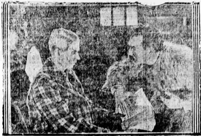
A scene from "Kazan," showing at the Liberty Sunday and Monday.