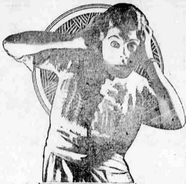
SCENE FROM "NO WOMAN KNOWS" A UNIVERSAL JEWEL PICTURE