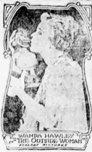
Grand, Tonight Last Time.