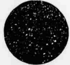
Crolide Compound Rubber —has no large "lumps." Notice how finely divided the particles are. This even texture is what makes Thermoid Tires wear so long.