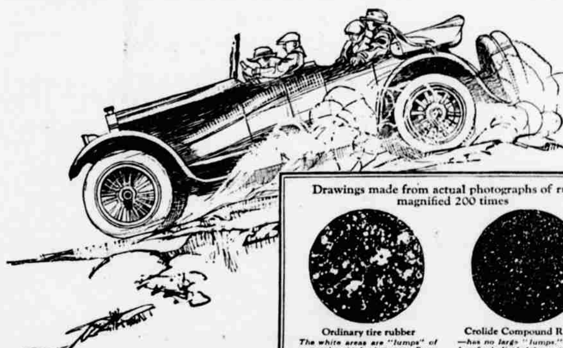
Drawings made from actual photographs of rubber magnified 200 times