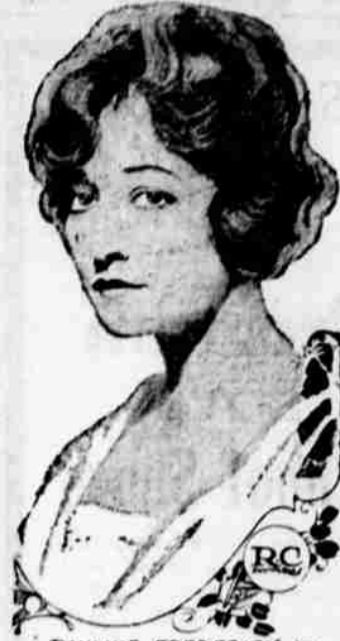
PAULINE FREDERICK 176 A SLAVE OF VANITY At The Liberty Theatre, Wednesday Only

GENUINE "BULL" DURHAM tobacco makes 50 good cigarettes for 10c