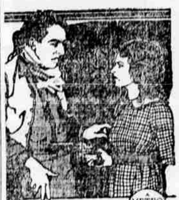
Two-Gun Cupid Makes a Western Bad Man Throw up His Hands

SEE THE SUPER SPECIAL THE GREAT REDEEMER A MAURICE TOURNEUR PRODUCTION with House Peters & A NOTEWORTHY CAST