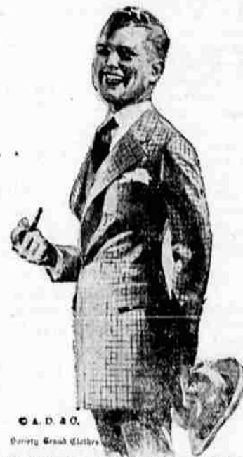
C. A. D. O. Society Brand Clothes

Regulation Navy Shoes; regular $13.50 value; now.....$10.00