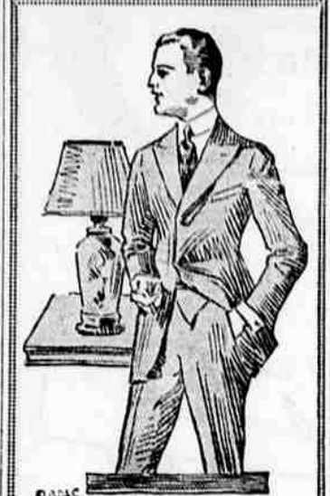
Society Brand Clothes

FOR SALE—Used Ford cars. Cars guaranteed—Cent.-Oro. Motor Co. 63-41tfc