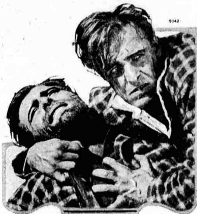
WALLACE REID in "The Valley of the Giants"