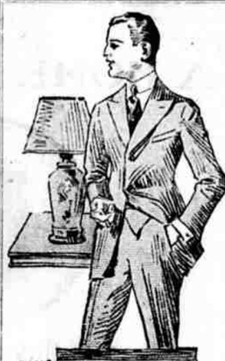
Society Brand Clothes

The boundaries of said proposed irrigation district are set forth and described particularly as follows, to- wit: Beginning at the SE corner of the NE 1/4 of Section 23, Township 17 South Range 11 E. W. M., De- schutes county, Oregon; thence west to the SW corner of the NE 1/4 of Section 23, said township and range; thence north to the NW corner of the SW 1/4 of the NE 1/4, Section 23, said township and range; thence east to the NE corner of the SE 1/4 of the NE 1/4, Section 23, said town- ship and range; thence north to the SE corner of the NE 1/4, Section 14, said township and range; thence west to the SW corner of the SE 1/4 of the NE 1/4, Section 14, said town- ship and range; thence north to the NW corner of the NE 1/4 of the NE 1/4, Section 14, said township and range; thence west to the NW corner of Section 14, said township and range; thence north to the NE corner of the SE 1/4 of the SE 1/4, Section 10, said township and range; thence west to the NW cor- ner of the SE 1/4 of the SE 1/4, Sec- tion 10, said township and range; thence north to the NW corner of the SE 1/4 of the NE 1/4, Section 10, said township and range; thence