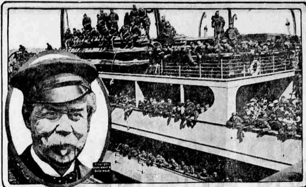
The Aquitain as she appeared docking at New York with almost 6,000 troops from Wisconsin, Michigan, Ohio and other western states and some notable personages, including half a dozen brigadier generals and Sir Thomas Lipton, the noted English yachtsman, portrait of whom is inserted.