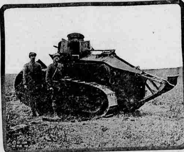
This is one of the small British tanks that do such valiant service in wiping out the machine-gun nests that the enemy relies on to make good his retreat.