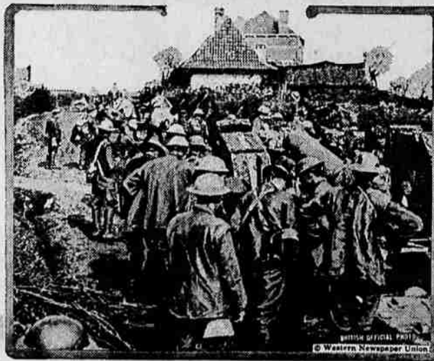
This British official photograph shows British soldiers making preparations to go up to the front with a battery. Note the caterpillar wheels of the big gun.