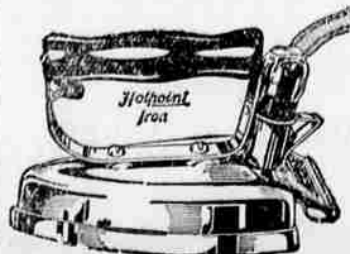
Hotpoint Electric Irons, $5.00. The Power Co.