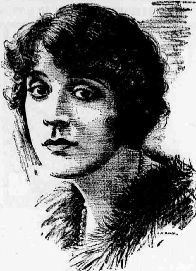
JANE COWL Goldwyn Pictures

GRAND THEATRE! WHERE GOOD PICTURES ARE SHOWN