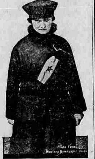
Here is the latest fad in war-time costumes. The woman who has a relative in the army or navy wears a small service flag as shown in the photograph.