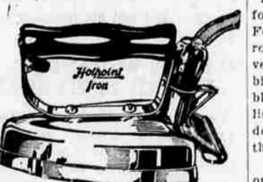
Hotpoint Electric Irons, $5.00. The Power Co.

* I have a plan by which this can be done in a single operation, (less the cinders). My plan will necessitate the construction of special machinery and will involve some money. Would like to correspond with those inter- ested. Inquire by letter to Bend Bulletin. 305-11c