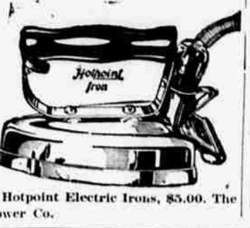
Hotpoint Electric Irons, $5.00. The Power Co.