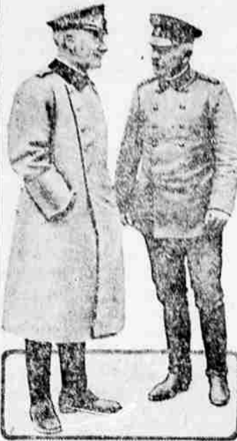
General Baron von Freytag-Loringhoven, chief of the supplementary general staff of the German army, has declared that the general political and economic situation of the war works only in favor of the allies and that Germany's soldiers will be defrauded of the fruits of her victories. General Loringhoven believes trench warfare a great mistake and thinks that only an aggressive attack would have brought success. He adds, however, that the German offensive was not strong enough to overthrow the allies. He is shown, at left in photograph talking with a member of his staff.