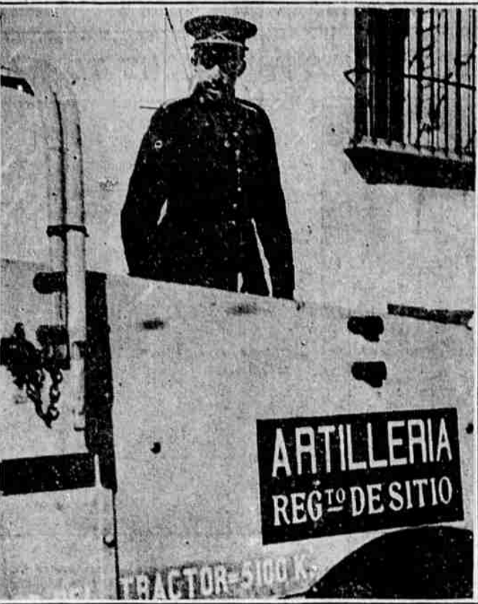
King Alfonso, seen above inspecting a military tractor, in all probability would become the first president of Spain if that country should change to a republic. His popularity with the people is strong in Spain.