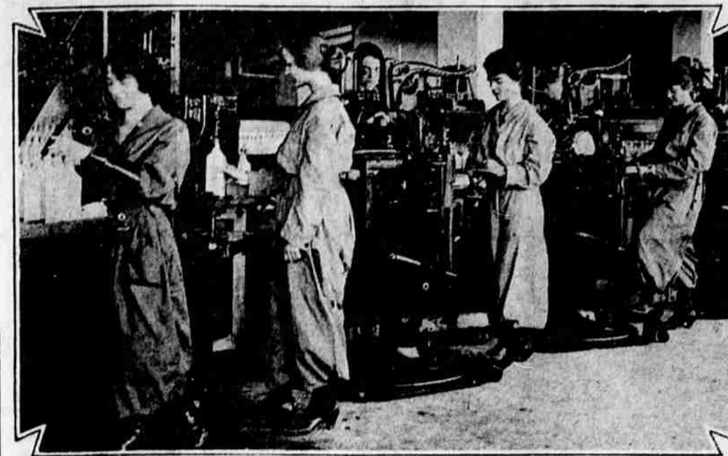
Because of the call to arms of many of their male employees, factories of the country are training girls to fill the vacancies. These girls are filling medicine bottles in a New Jersey factory and wear baggy trousers.