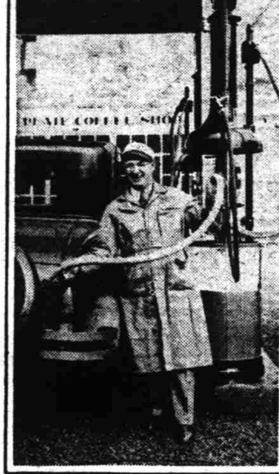
Coffee and gas sales are bringing in the shekles for Ping Bodie, former New York Yankee and one-time slugging pal of Babe Ruth, now that his baseball days are over. At left Ping is shown at his pump and at right with Mrs. Bodie in their coffee shop in San Francisco, Cal. Two of his baseball trophies are against the wall.