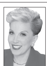
JEANNE PHILLIPS ADVICE

Dear Kid: Tell your parents you want to talk to them about an allowance. Ask what things you could do to help around the house in order to earn one and how much they are willing to pay you for doing them. As to how much to expect, this will depend on what your parents may be able to afford. Ask them if you can negotiate to find an amount you all agree upon. And if you need more money, doing similar chores for a relative or neighbor might be a good place to start.