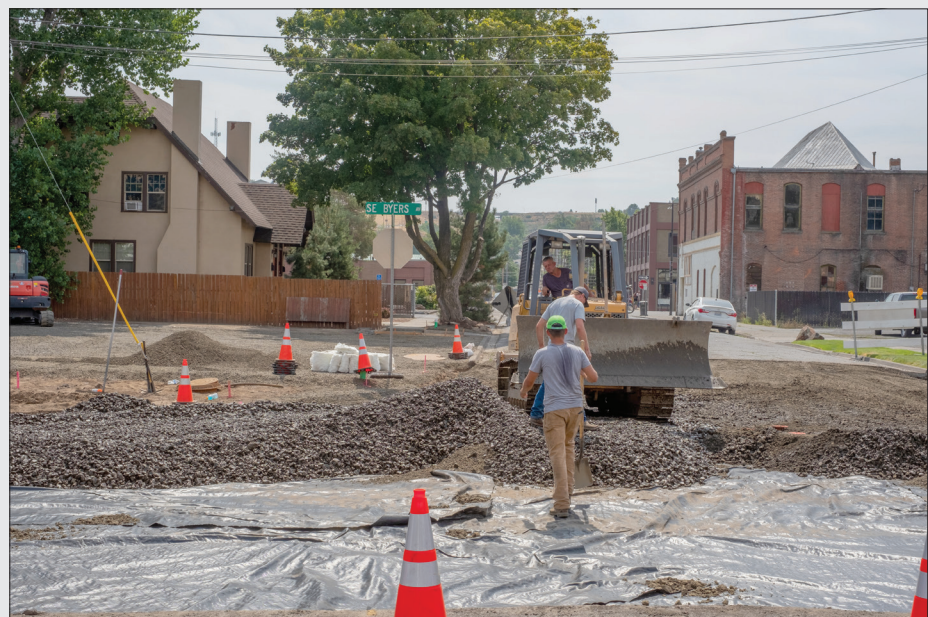
Road construction workers Thursday, Aug. 18, 2022, cover Southeast Byers Avenue at the intersection with Third Street, Pendleton, with black tarps and gravel. The construction stretches along Southeast Byers from Main Street to Seventh Street.