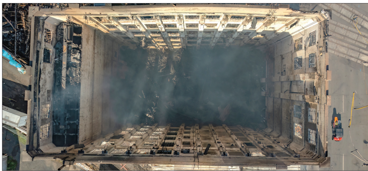
The burned-out structure of the Grain Craft flour mill in Pendleton continues to smoke Aug. 11, 2022, a day fire destroyed the building.

A timeline for demolition has yet to be established, but there are discussions of opening an on-site asbestos testing facility, according to Pendleton Buildings Official Ty Woolsey.