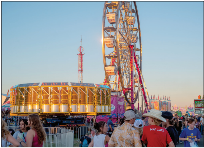
Hundreds of people gather to enjoy the Umatilla County Fair's last day on Saturday, Aug. 13, 2022, in Hermiston.