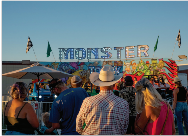
The sun sets as a group of people watch children on the Monster Truck ride Saturday, Aug. 13, 2022, at the Umatilla County Fair in Hermiston.