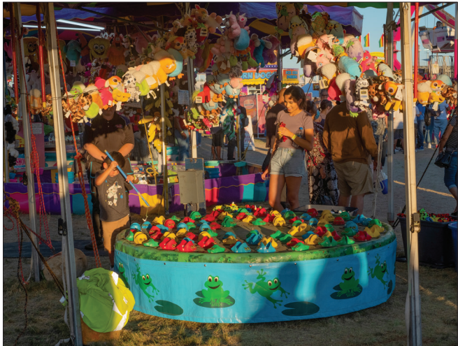
A young boy fishes for frogs Saturday, Aug. 13, 2022, and tries to win a toy at the Umatilla County Fair in Hermiston.