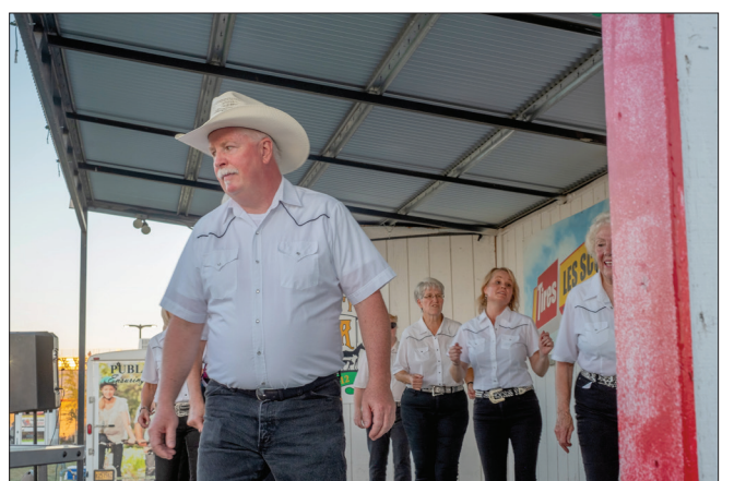
The dance group, Steppin' Country from Walla Walla takes the stage Saturday, Aug. 13, 2022, at the Umatilla County Fair in Hermiston.