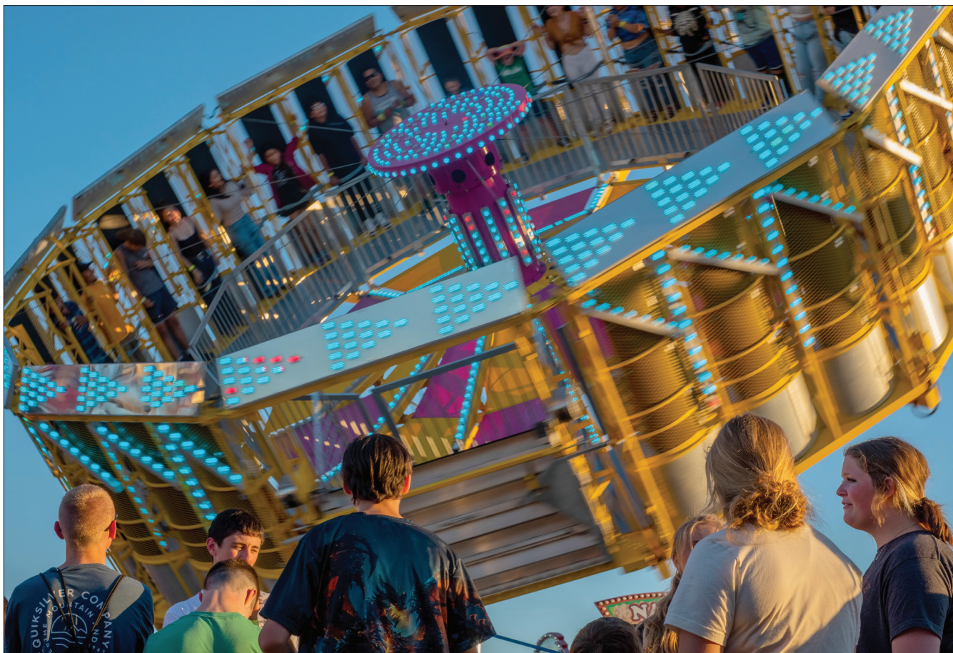
Zero Gravity tilts and spins Saturday, Aug. 13, 2022, as people wait in line to get on the ride at the Umatilla County Fair in Hermiston.