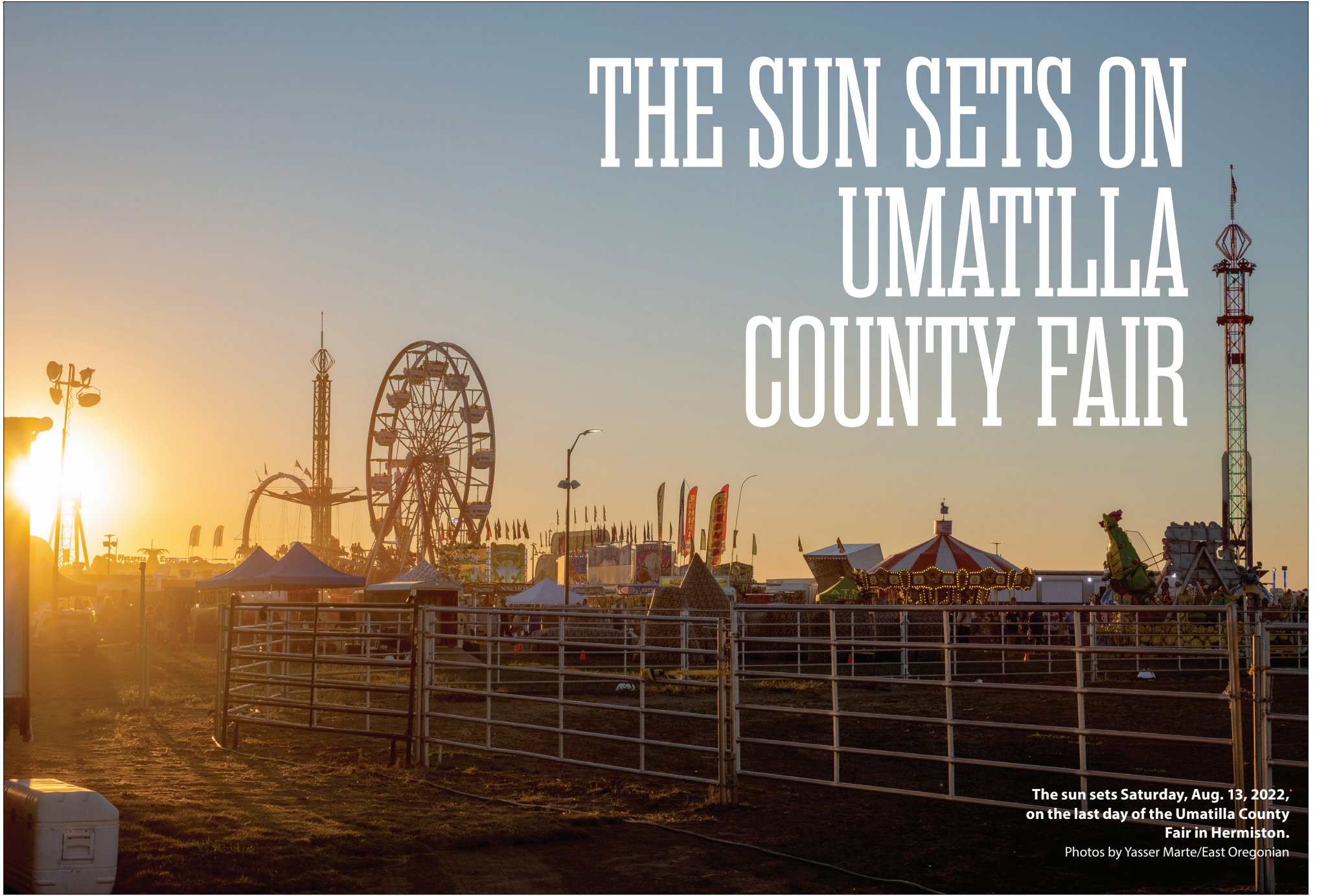
The sun sets Saturday, Aug. 13, 2022, on the last day of the Umatilla County Fair in Hermiston.