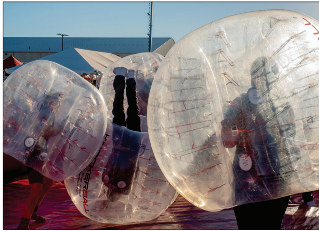
Children bump and flip upside down Saturday, Aug. 13, 2022, playing Knockerball at the Umatilla County Fair in Hermiston.