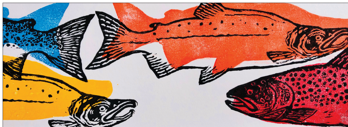
Corrine Vegter will show her fish-inspired art at Sweet Wife Baking in July.

As part of this exhibit, Crossroads will hold a sustainable agriculture practice panel on