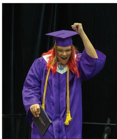
A Hermiston High School graduate exults after receiving her diploma during commencement ceremonies June 9, 2022, at the Toyota Center in Kennewick. Hermiston School District reported 355 students graduated on time. The school had 382 seniors, plus eight students from the district's Next Steps program.