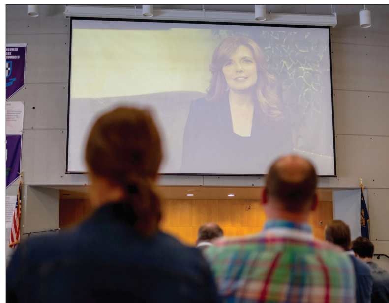
Yasser Marte/East Oregonian