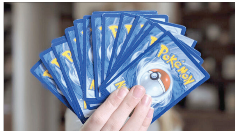
Learn how to play Pokemon in a class at Pendleton Center for the Arts.

TCG stands for "trading card games," which is a fun way to make new friends and share