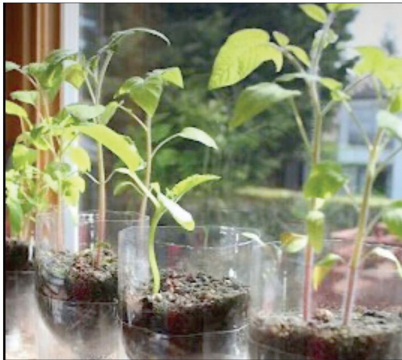
Kids will learn how to recycle, reduce and reuse in a workshop that begins June 15 at Pendleton Center for the Arts.

Kids now have full access to the PCA's art materials and studio space, inspiring them to explore art independently through open-ended drawing, painting and collage, or anything their imagination designs. The emphasis is on creative learn-