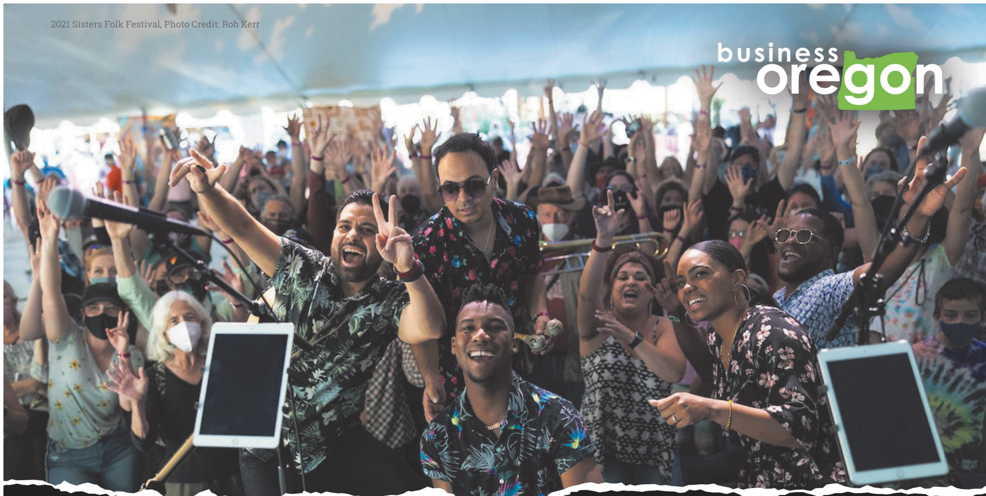
2021 Sisters Folk Festival