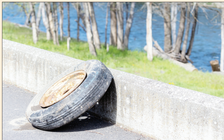
An old tire sits where a volunteer placed it for pickup Saturday, April 23, 2022, during the cleanup along the Pendleton River Parkway.