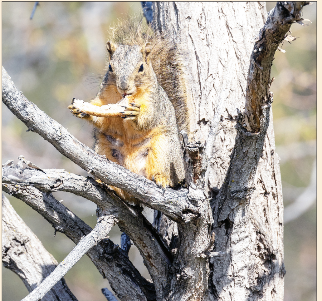
A squirrel eats a scrap of bread Saturday, April 23, 2022, as volunteers work below along the Pendleton River Parkway.

The event featured a tree and shrub giveaway in recognition of Arbor Day that offered northern red oak, western larch, aspen, golden currant, mock orange and others. The Pendleton Tree Commission, Pendleton Parks & Recreation, the Umatilla National Forest and Oregon Community Trees teamed up to offer the free flora. Arbor Day is April 29.