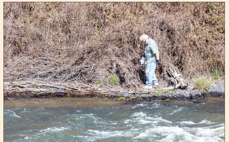
A volunteer hunts for trash Saturday, April 23, 2022, along the banks of the Umatilla River during the Spring 2022 River Cleanup in Pendleton.