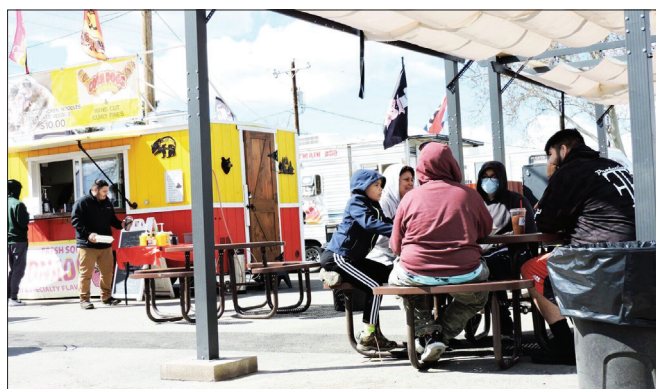
Diners congregate at the Hermiston Food Pod on Friday, April 15, 2022.