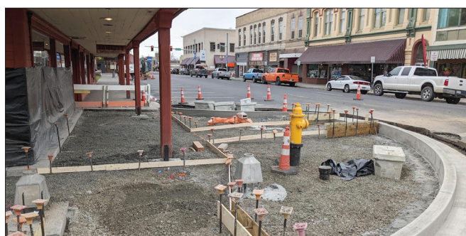
Curb and sidewalk improvements remain underway Tuesday, April 19, 2022, along the Southeast Court Avenue side of the Hamley Western Store & Saddle Shop in downtown Pendleton.