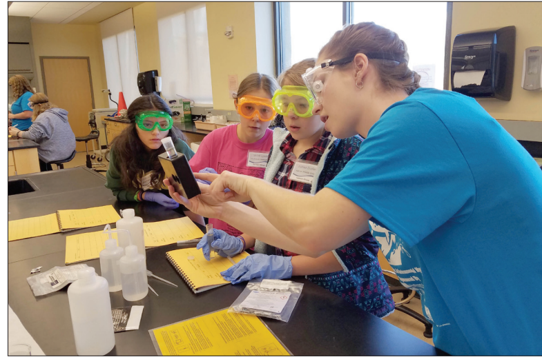
The Eastern Oregon University Chemistry Club will lead hands-on activities for an Earth Day Extravaganza on Friday, April 22, from 3-4 p.m. at Cook Memorial Library in La Grande.