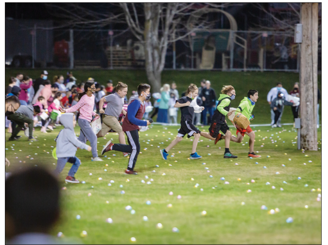
Children sprint onto the soccer fields April 2, 2021, at Butte Park in Hermiston at the start of the Flashlight Easter Egg Hunt. The park will go dark for the 2022 event at 8 p.m. on Friday, April 15.