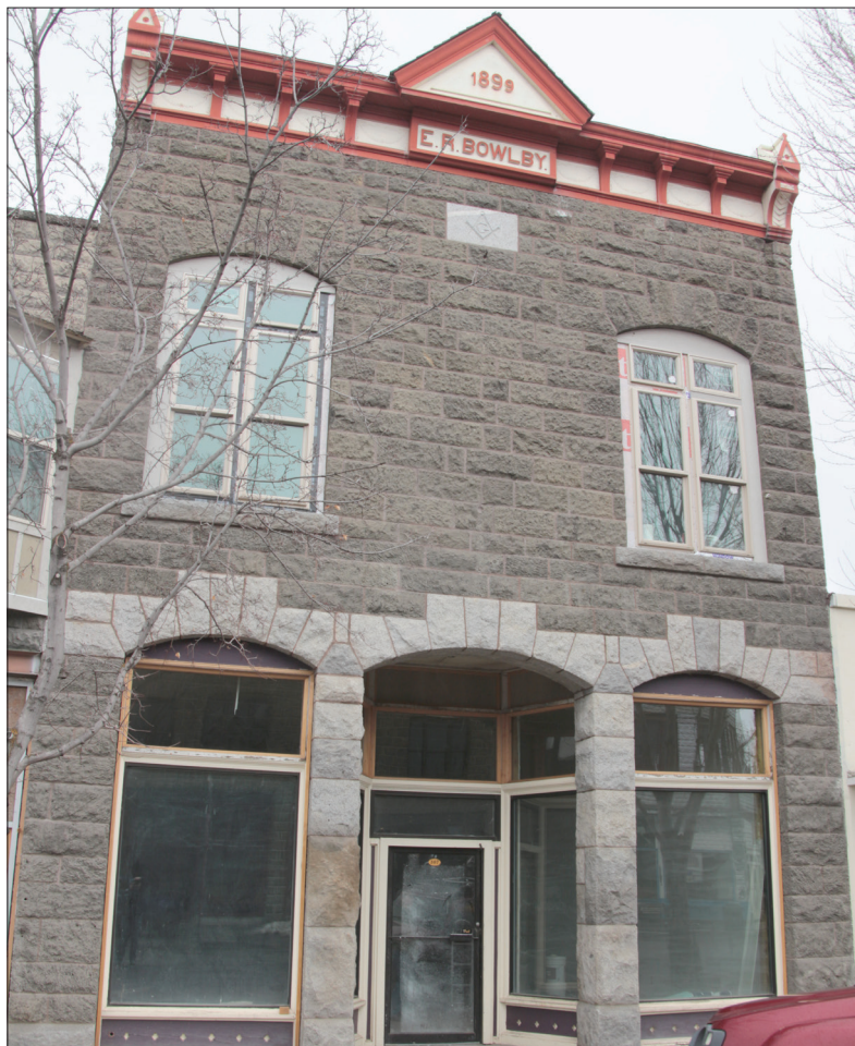
Fishtrap's new home will be in the Bowlby Building on Main Street in Enterprise.