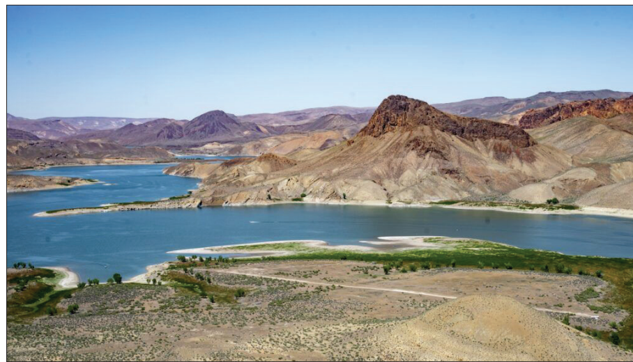
Lake Owyhee in southeastern Oregon is a major source of irrigation water for farms in Malheur County.

Some of the best numbers for figuring where the state is on water supply can be found in the Snotel reports, a water